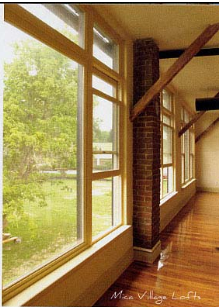
Mica Village Lofts

Amid the cobblestone streets and cafés of Manhattan's downtown TriBeCa neighborhood comes Artisan Lofts, an 18-story conversion of a historic Art Deco building. Behind the cast-iron columned façade, constructed circa 1929, stretch 37 new lofted residences with 11-foot ceilings, hardwood plank floors, board-formed concrete ceilings, 8-foot-tall, steel casement windows and [deep breath] splayed interior columns. Two-, three- and four-bedroom units range from 1,500 square feet to 4,260 square feet and from $2.25 million to $7.47 million. Adding to the arty downtown vibe is a curated art gallery in the lobby and artisan garden on the roof. Other pluses include a fitness center with yoga and treatment rooms, refrigerated storage for grocery deliveries and wood-burning fireplaces in select residences.