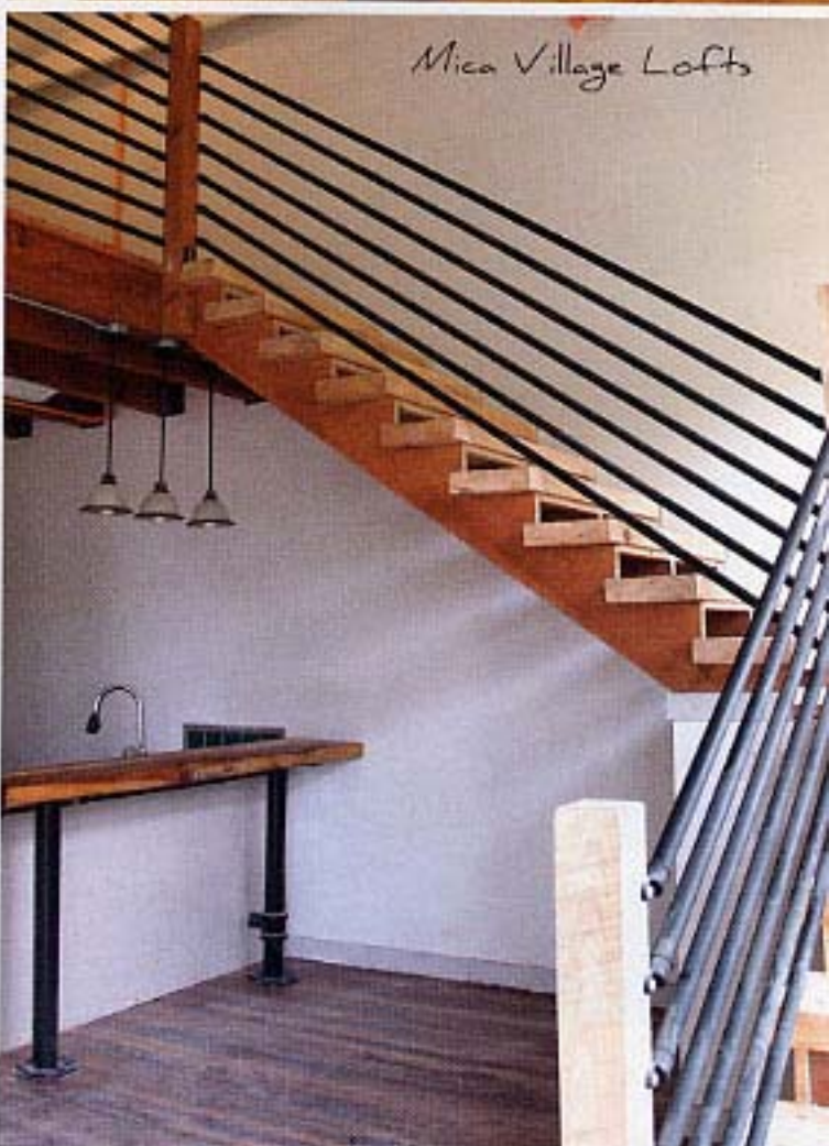
Mica Village Lofts

In Asheville's River Arts district, a downtown neighborhood overflowing with galleries and working art studios, urban industrial living has gone green. The Mica Village Lofts are the restoration and conversion of the Schoonmaker Mica Company building, constructed in 1899, into 10 residential loft spaces. More than 60 percent of the materials used to construct the building were salvaged or recycled from the original plant. The glass used in the lobby's terrazzo floor and in the lofts' countertops came from broken windows; the metal used to support the kitchen bar countertops are from the factory's plumbing pipes. Residences feature exposed brick walls, original hemlock beams, exposed pipes and ducts, and restored original wood flooring. One-bedrooms begin at 830 square feet; prices start at $226,000.